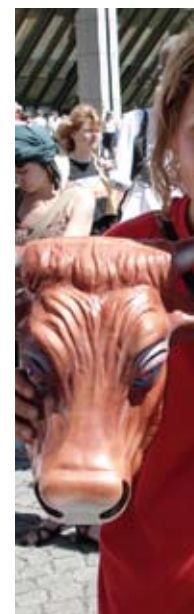
Participants at the Planet D