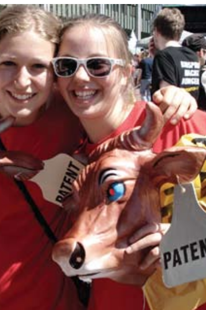
Diversity demonstration, Bonn, 12 May 2008.

The process in the CBD is a negotiation about genes and traditional knowledge. In many cases, these genes arise from our territories, lands and waters and the knowledge related to those genes is ours. Therefore, any decision making about the rules to regulate the buying and selling of those genes and Indigenous knowledge must include our right to make our own decisions about what will be the best path for our future generations based on our own cultural and spiritual beliefs and related customary and/or codified laws. 🌱