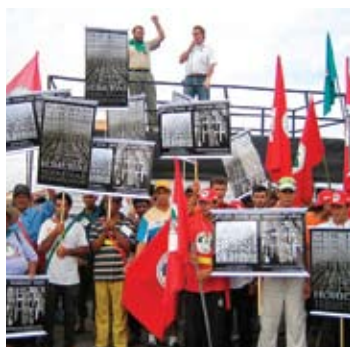
Lively demonstration at COP-8, lead by Movimento dos Trabalhadores Rurais Sem Terra (MST).