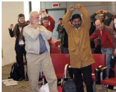
Some civil society representatives pretending to be trees in Rome, Italy just prior to the 13th SBSTTA.