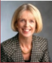
Bärbel Dieckmann , Mayor of Bonn, Germany