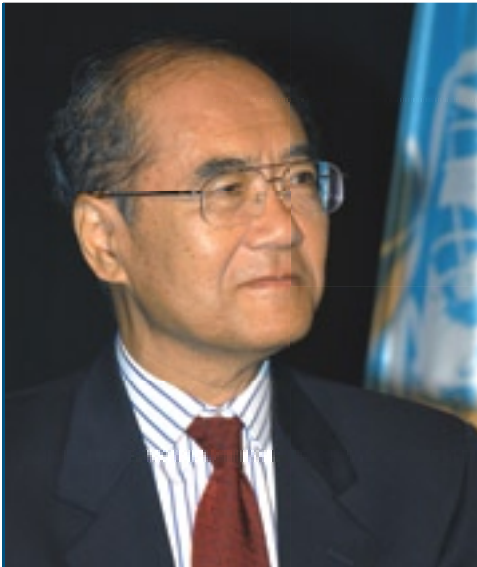
Koïchiro Matsuura , Director-General of the United Nations Educational, Scientific and Cultural Organization (UNESCO)

Biodiversity conservation work in China has made big progress after long-term unremitting efforts with enhanced capacity and containment of the loss of biodiversity. Right now, biodiversity conservation work in China is marching toward the 2010 Biodiversity Target. ✎