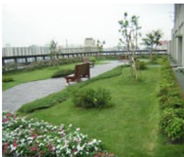
"A green roof on BROTHER INDUSTRIES, LTD." Mizuho Ward, Nagoya City, Japan

Cities and local authorities and their partners have a major role to play in promoting the positive impacts of integrating biodiversity into urban planning and development. Already, as